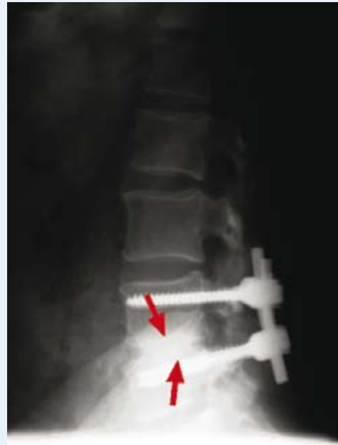
Figure 2: b) Quality and continuity of fusion are seen in direct lumbar radiography

Severe low back pain can be seen in patients with chronic instability caused by lumbar degenerative disc disease. In these patients, as previously mentioned, instability cannot be seen on dynamic